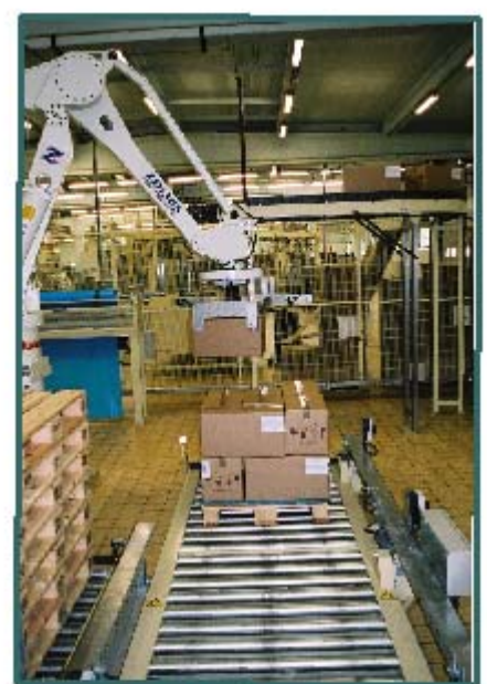
Robot pakt dozen, pallets en vellen.

Wals Systems B.V. specialist in transport & handling systemen