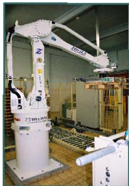
Robot met universele gripper