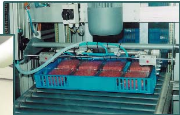
Pick & place unit