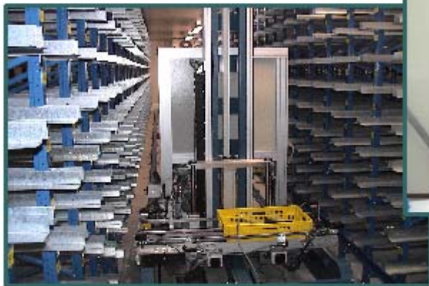
Mini- Load t.b.v. krattenopslag